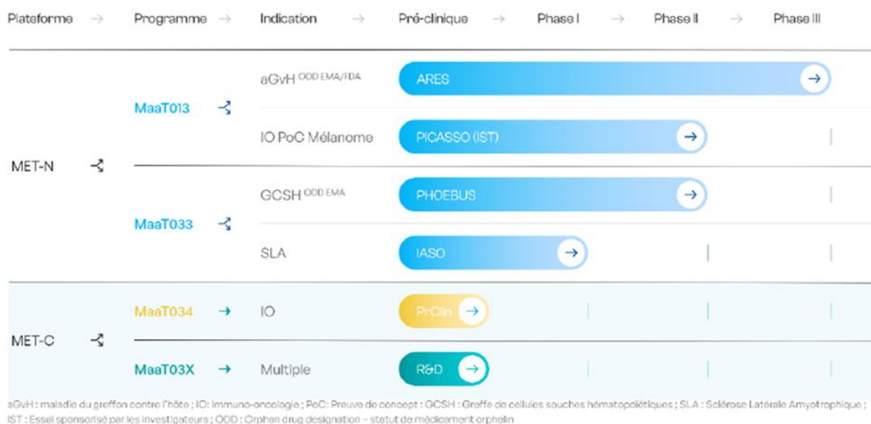
Figure 1. Portefeuille des produits de MaaT Pharma